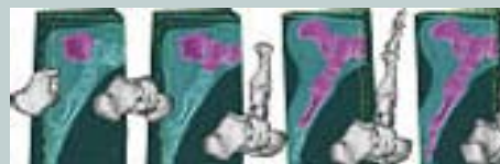
New computer software program will allow surgeons to instantly visualize any part of a patient's anatomy.

Barrett credits recent breakthroughs in algorithms that allow the program to work in a kind of paint-by-number fashion, extracting objects from coarse to increasingly